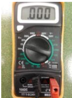
Figure 3(a): Voltmeter Setting

In the figure below, you can see the settings for a DMM to use is as a voltmeter (a) and an ammeter (b).