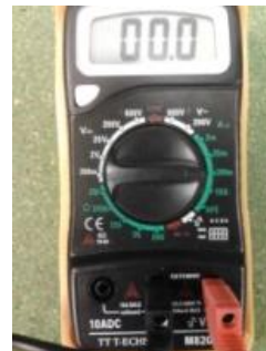
Figure 3(b): Ammeter Setting