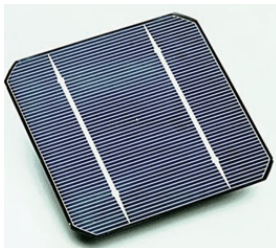
Figure 1: Solar cell

The sun produces 3.9 \times 10^{26} watts of energy every second. Of that amount, 1,386 watts fall on a square meter of Earth's atmosphere and even less reaches Earth's surface. This energy can be used to generate electricity without producing pollution or dangerous wastes. Solar cells generate electrical power by converting solar radiation into direct current electricity. Currently solar cells generate a tiny fraction of the total global power-generating capacity from all sources. However, it is one of the fastest growing power-generation technologies in the world. Developing solar power is a critical part of sustainable energy policy, particularly as the costs and consequences of burning fossil fuels increase.