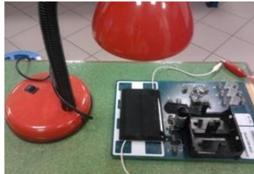
(a) Figure 2: (a) Solar cell efficiency test circuit diagram (b) Experimental set up