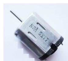
Figure 4: An Electric motor

An electric motor is an electric machine that converts electrical energy into mechanical energy. In this experiment, we will use a toy electric motor and a propeller attached to it. We will connect the electric motor to the solar cell and rate the efficiency of solar cell with observing the turn speed of the propeller.